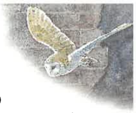
Barn owls like derelict buildings as nesting sites

Continue to follow the signposted bridleway to Oxcombe Road. When you meet Oxcombe Road, turn left 8 and continue to Belchford.