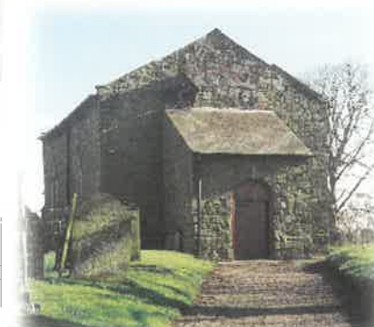
Church of St Peter and St Paul, Belchford built of local 'greenstone'

Follow the road left and continue to the outskirts of the village. Where the road turns sharp right, go straight ahead on the bridleway. The bridleway, Platts Lane 7, is part of a Roman 'salt road' - one of a number linking the east coast salt producing area with Lincoln. Salt was of major importance to the Romans for preserving meat, fish and beans.